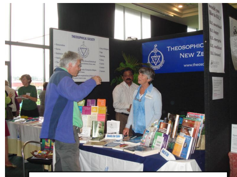
(Some of) the workers

around - many thanks to those who helped out on the weekend with transportation and manning the stall. We received a great many enquiries and even sold a few books!