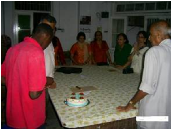
TOS Members cut the Foundation Day cake