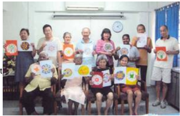
Residents of the AWWA Home in Singapore with their artwork from a colour therapy workshop.

During the sessions, residents work on specific designs on particular themes, working with colours on the concept of a 'circle' format, to promote One-ness and develop one-pointedness.