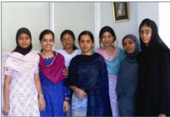
A group of young beneficiaries of the educational sponsorship program

One of the longest running activities of the TOS in Pakistan is the organisation of educational sponsorships for students of primary, secondary and college levels. The TOS has been working to provide opportunities for bright young people who are unable to afford an education. The applicant is interviewed and the case is investigated. After the necessary investigation a sponsor is found.